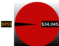
ROOF PROJECT: Phase1 Goal $35,000